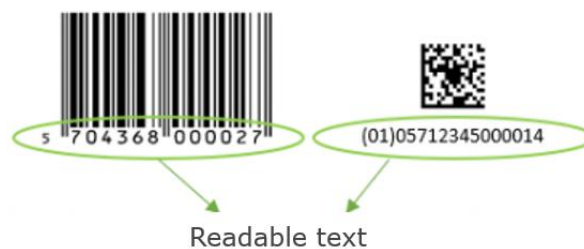
Figure 7: Example of readable text. Note that Application Identifier (01) must be part of the readable text when a GS1 DataMatrix is used.

When an EAN-13 barcode is used, the readable text is placed below the barcode. The readable text encoded shall always be printed adjacent to the GS1 DataMatrix, while protecting the quiet zones. In circumstances with extreme space constraints it is possible to leave out some of the readable text or the entire text related to the barcode, however, if possible it is important to have the GTIN in readable text. For more information on human readable interpretation, see section 4.15 in GS1 General Specifications .