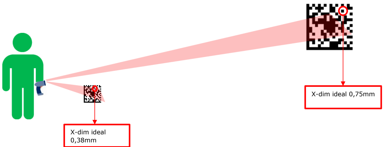
Figure 6: GS1 DataMatrix, size difference

The height and width of a GS1 DataMatrix depend on the size (measured in millimeters) of each square in the GS1 DataMatrix (this is called the x-dimension), and on the amount of data encoded. Resize the x-dimension in order to resize the GS1 DataMatrix (See figure 6).