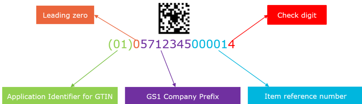
Figure 4: Example of a GS1 DataMatrix containing a GTIN

Since a GS1 DataMatrix can contain a lot of information, it is important to specify what information is encoded in the barcode. This is done by applying Application Identifiers. Application Identifier for GTIN is (01). Note that the parentheses must only be expressed in the human readable text and not encoded in the barcode.