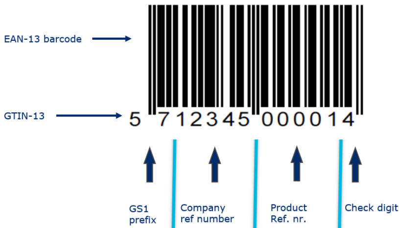
Figure 2: Structure of the EAN-13 barcode